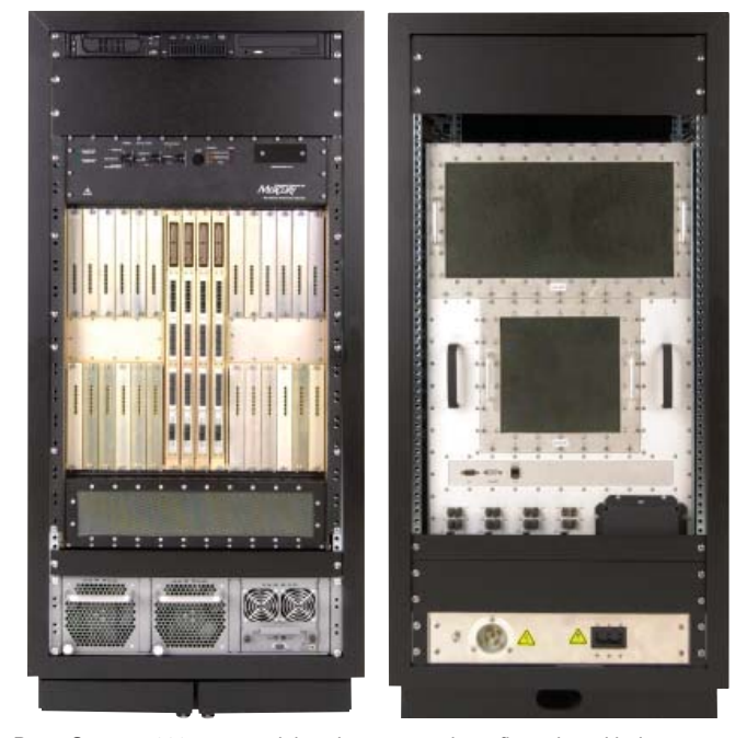
PowerStream 7000 commercial environment rack configuration with door removed

The PowerStream 7000 system is designed to satisfy the reliability, availability, and serviceability (RAS) needs of field applications. Internally, PowerStream 7000 systems use the industry-standard Intelligent Platform Management Bus IPMB) and PICMIG 2.9 IPMI over LAN (100 Mbit Ethernet) as the out-of-band fabric for system control and monitoring, and fault isolation and recovery. System configuration, monitoring, and reset can also be accessed by the application software through a Mercury API. Warnings and failures are indicated locally through frontpanel lights. The system automatically monitors fan failure, power supply failure, and chassis intrusion. Optional monitoring is available for under/ over temperature and airflow. Normally, faults cause the system to power down immediately or after a warning, or prevent system power-up. The system can be configured to override certain of these faults, or allow the user to override them using the "battle short" switch.