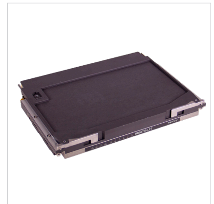
HDS6705 highly optimized, rugged, 6U OpenVPX board brings secure, data center processing capability to the tactical edge