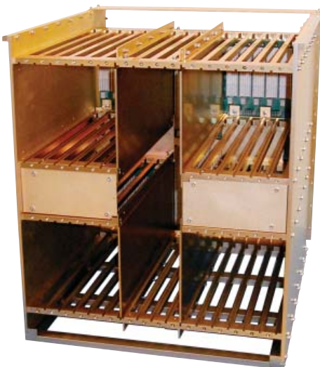
PowerStream 7000 sub-chassis

Each switch card also provides four 1 Gbit Ethernet connections for standard I/O, and four 100 Mbit Ethernet connections for system communication. All of the 1 Gbit Ethernet connections and one of the 100 Mbit Ethernet connections are accessible at the rear of the chassis. The three remaining 100 Mbit connections from each switch module go to each of the other three switch modules.