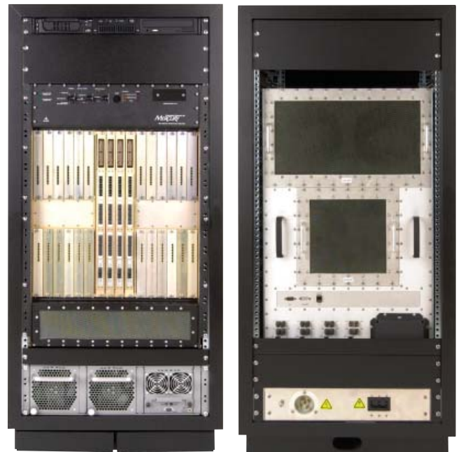
PowerStream 7000 commercial environment rack configuration with door removed

The PowerStream 7000 system is designed to satisfy the reliability, availability, and serviceability (RAS) needs of field applications. Internally, PowerStream 7000 systems use the industry-standard Intelligent Platform Management Bus (IPMB) and PICMIG 2.9 IPMI over LAN (100 Mbit Ethernet) as the out-of-band fabric for system control and monitoring, and fault isolation and recovery. System configuration, monitoring, and reset can also be accessed by the application software through a Mercury API. Warnings and failures are indicated locally through frontpanel lights. The system automatically monitors fan failure, power supply failure, and chassis intrusion. Optional monitoring is available for under/over temperature and airflow. Normally, faults cause the system to power down immediately or after a warning, or prevent system power-up. The system can be configured to override certain of these faults, or allow the user to override them using the “battle short” switch.