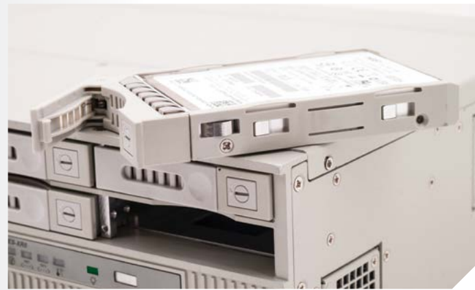
Eight Removable, Hot Swappable, Front Access Drives