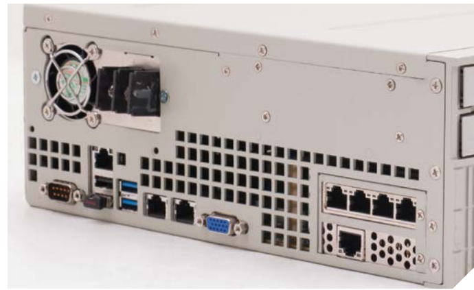
Maximum Configuration Flexibility